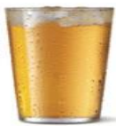
PINT CIDER: ABV 5.3% 3 UNITS