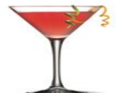
COSMOPOLITAN COCKTAIL 2 UNITS