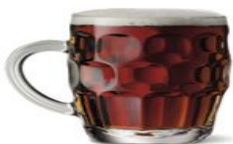
PINT BITTER: ABV 5% 2.8 UNITS